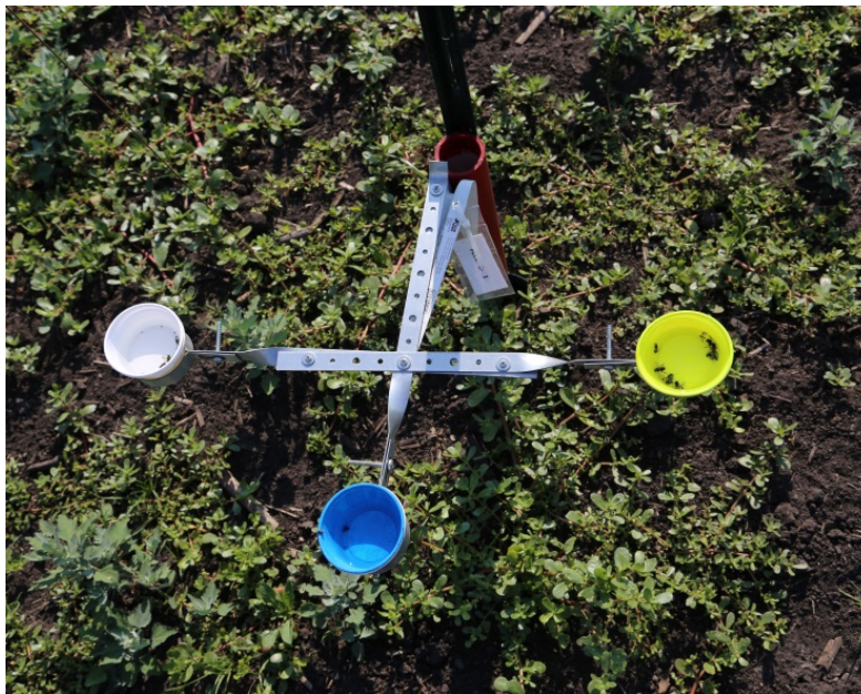
Figure 1. Bee bowl stand used to sample pollinating insects.