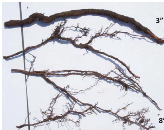
Figure 2. Roots collected at different depths from a MN1200 vine that exhibited symptoms of stress at bloom. Shallower roots were dead with phloem tissue sloughing off and absence of finer roots.